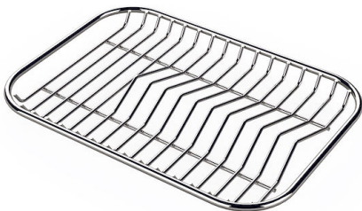
Stainless steel plate rack only usable in combination with the accessories 8644 003 8100 154