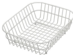
White basket 8612 100